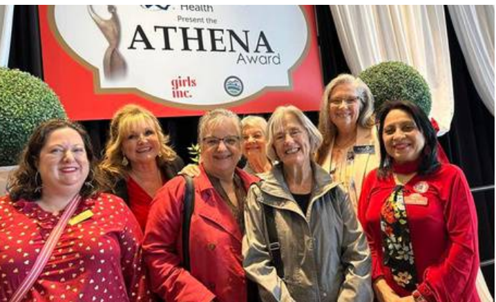
Branch Spotlight - Owensboro